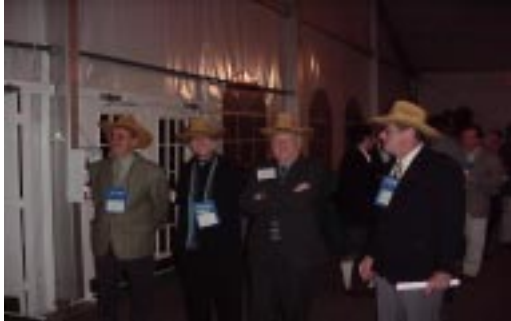
The Greeting Committee

A year of hard work and careful planning paid off with a very successful Annual Meeting of the Academy of International Business, November 17-20, in Phoenix, Arizona. The number of registrants reached a record of 738. All the participants benefited from the informative and useful program themed "In Search of Relevance of International Business Research: Impact on Management and Public Policy."