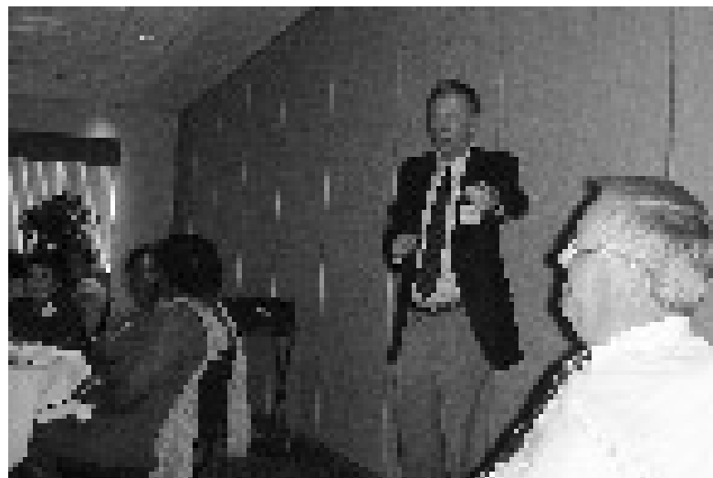
September IBF Luncheon